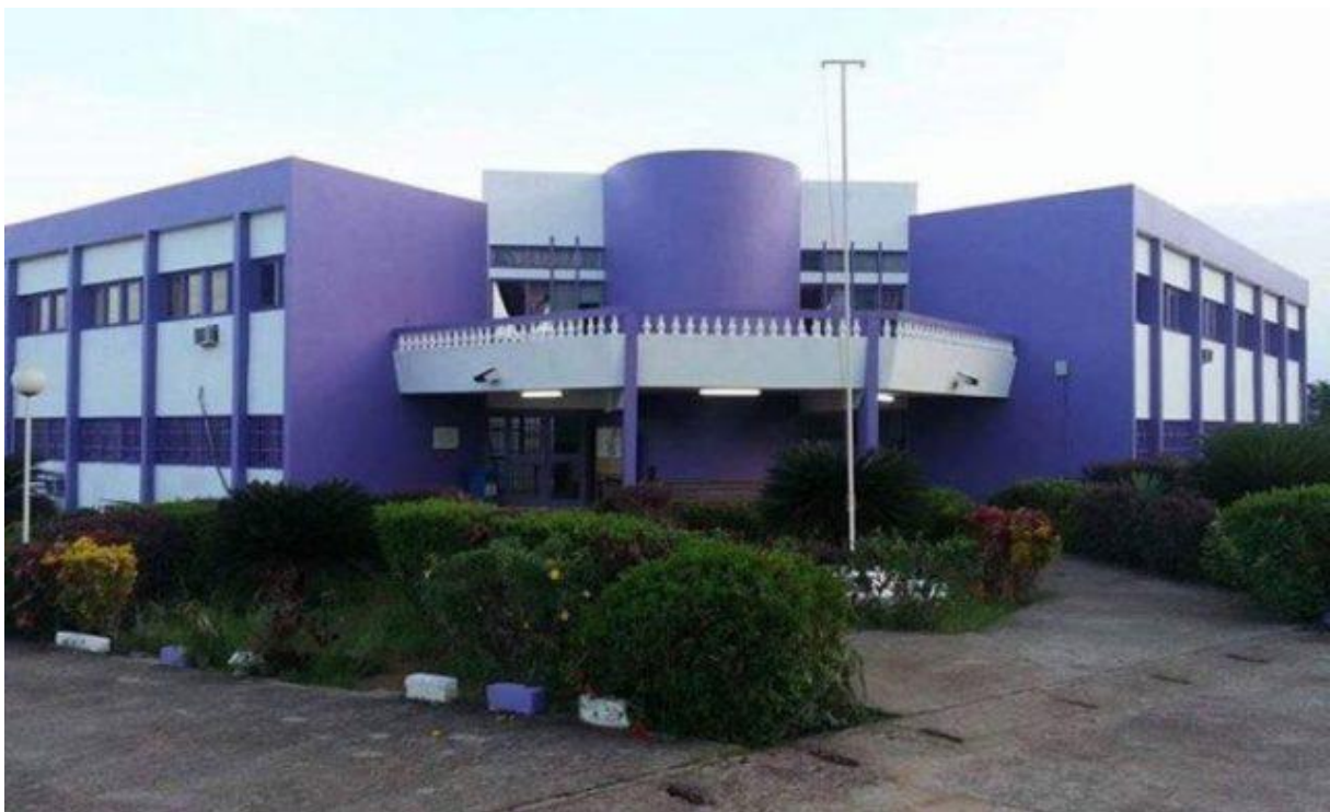
The Town Hall of the Municipality of Bouaflé

Côte d'Ivoire - All about the municipality of Bouaflé, in the Marahoué region.