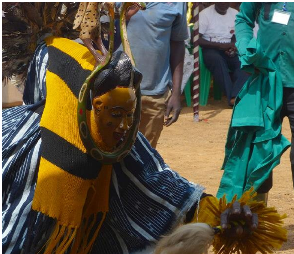
The Zaouli mask, a cultural icon of the Marahoué Region and an internationally renowned national dance